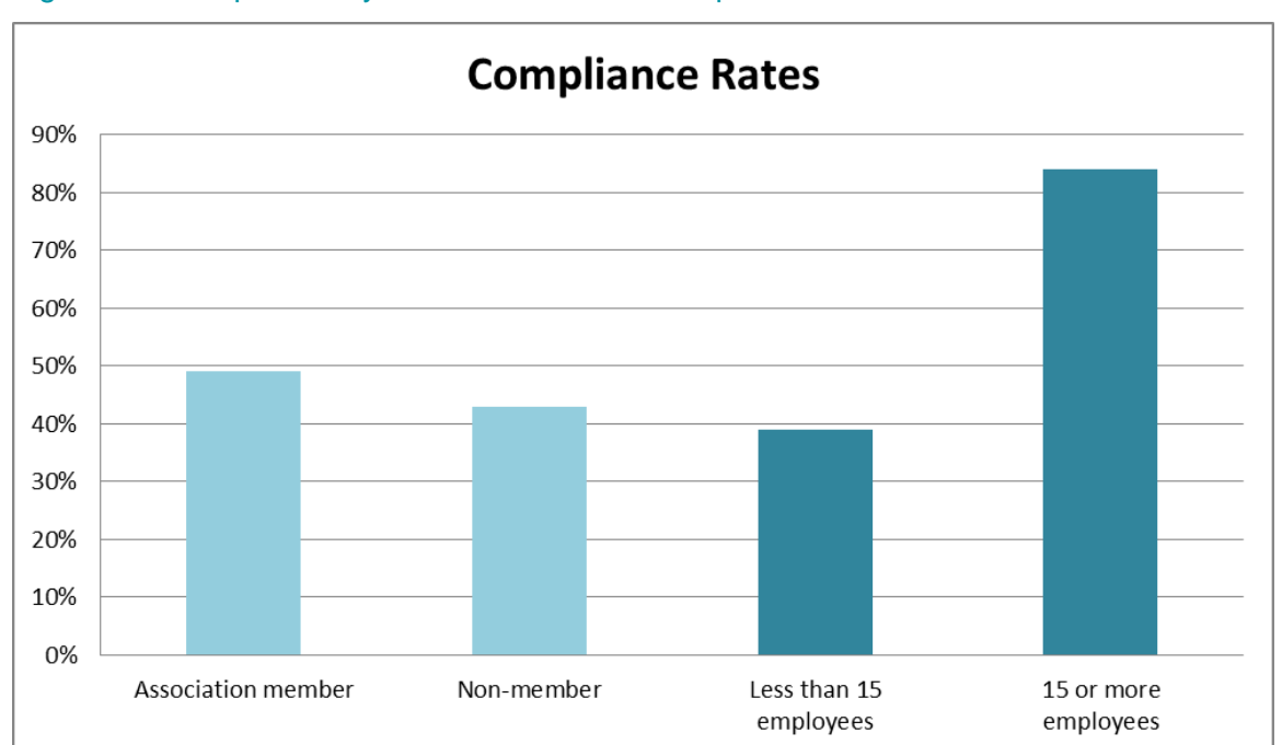
Figure 3 - Compliance by association membership and size

Larger businesses (those with 15 or more employees) had a higher compliance rate than smaller businesses (those with less than 15 employees). The compliance rate for larger businesses was 84% compared with a compliance rate of 39% for smaller businesses.