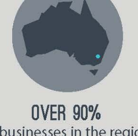
OVER 90% of businesses in the region are small businesses