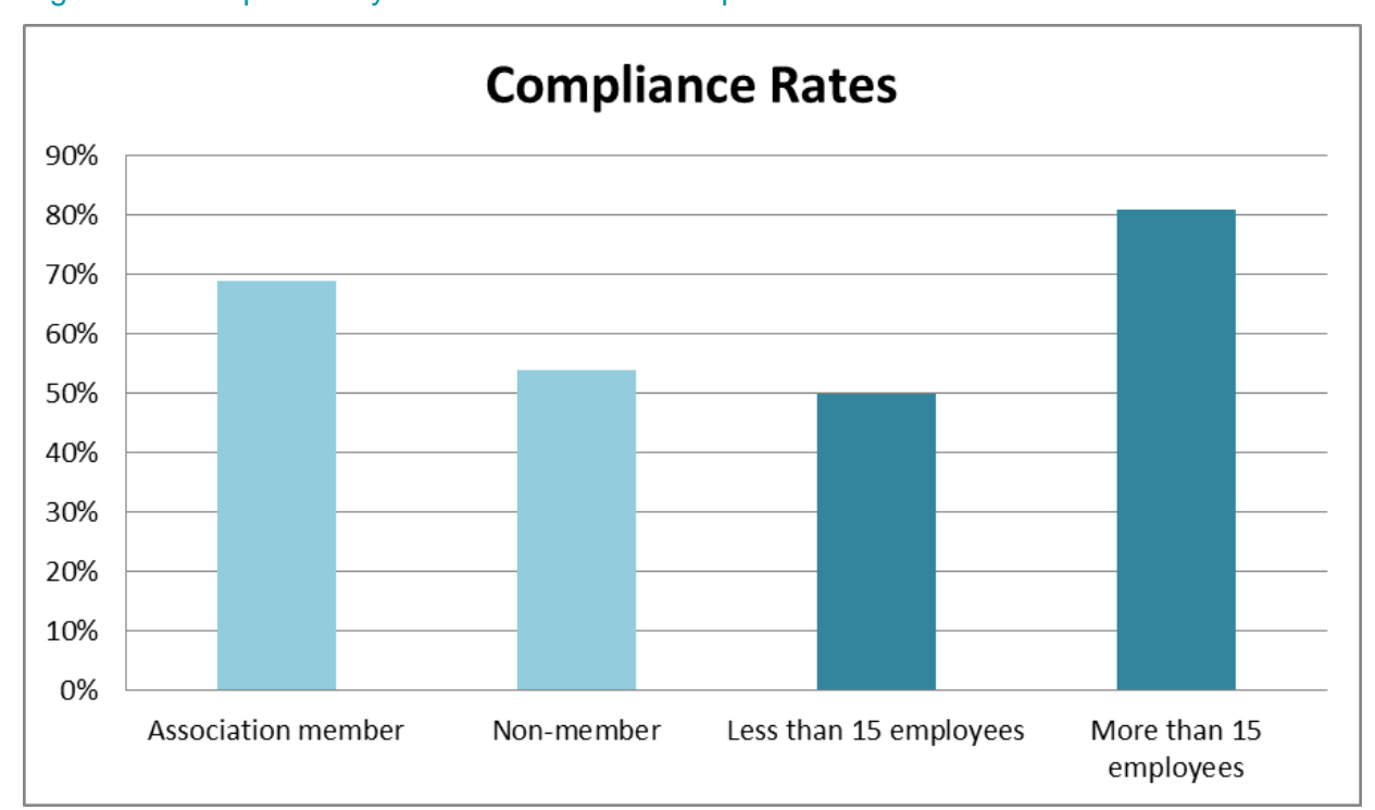
Figure 3 – Compliance by association membership and size

Of those smaller businesses, businesses with 1 - 4 employees were more likely to have made errors than businesses with 5-14 employees. Businesses with 1-4 employees had a compliance rate of 32%, compared to a compliance rate of 66% for businesses with 5-14 employees.