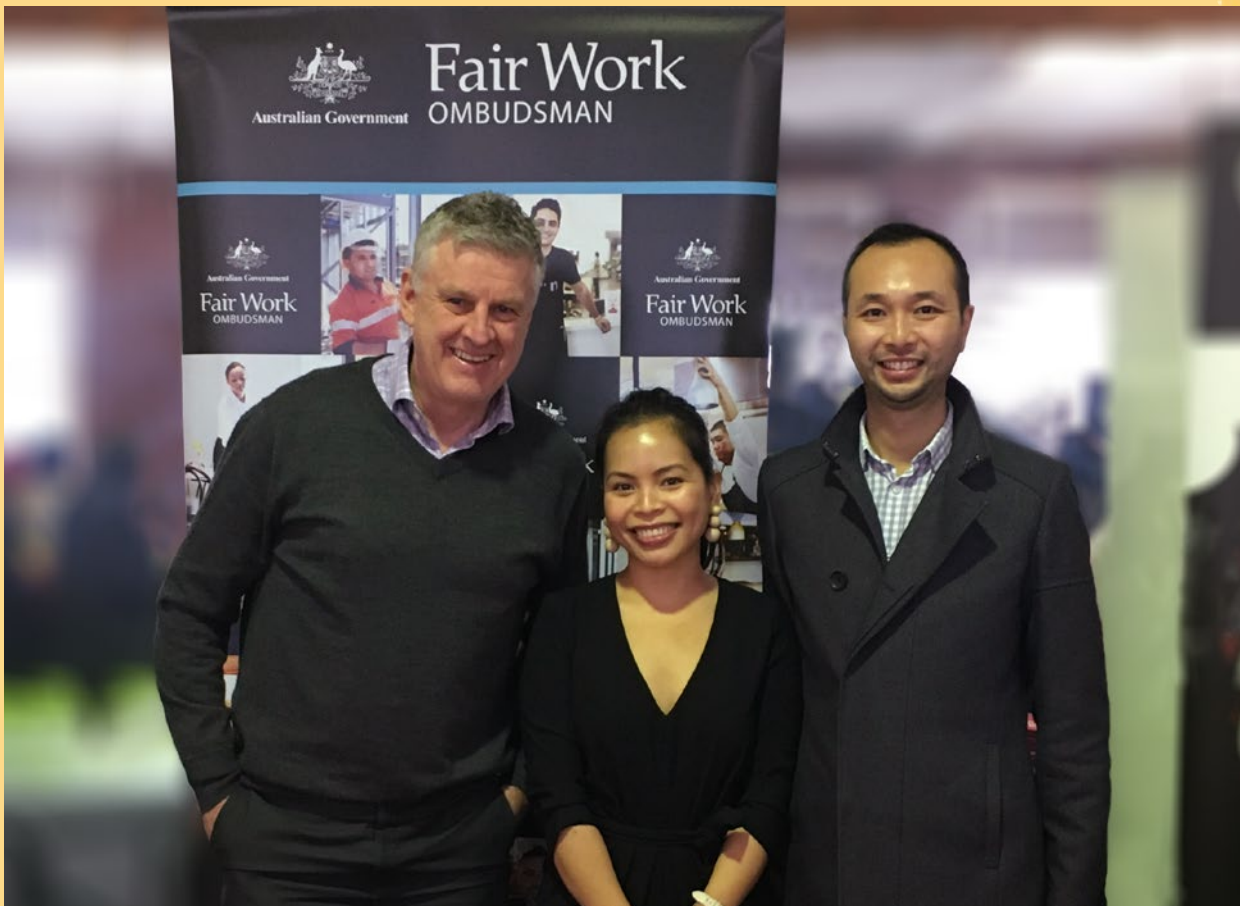
FWO employees promoting our education resources at a NAIDOC week event