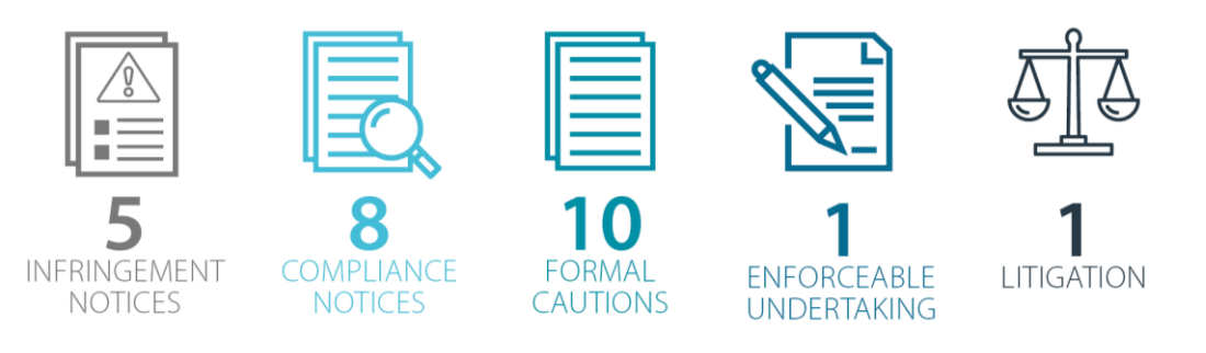
Figure 3: Summary of the compliance and enforcement actions taken

The following compliance and enforcement actions have been taken against the non-compliant stores: