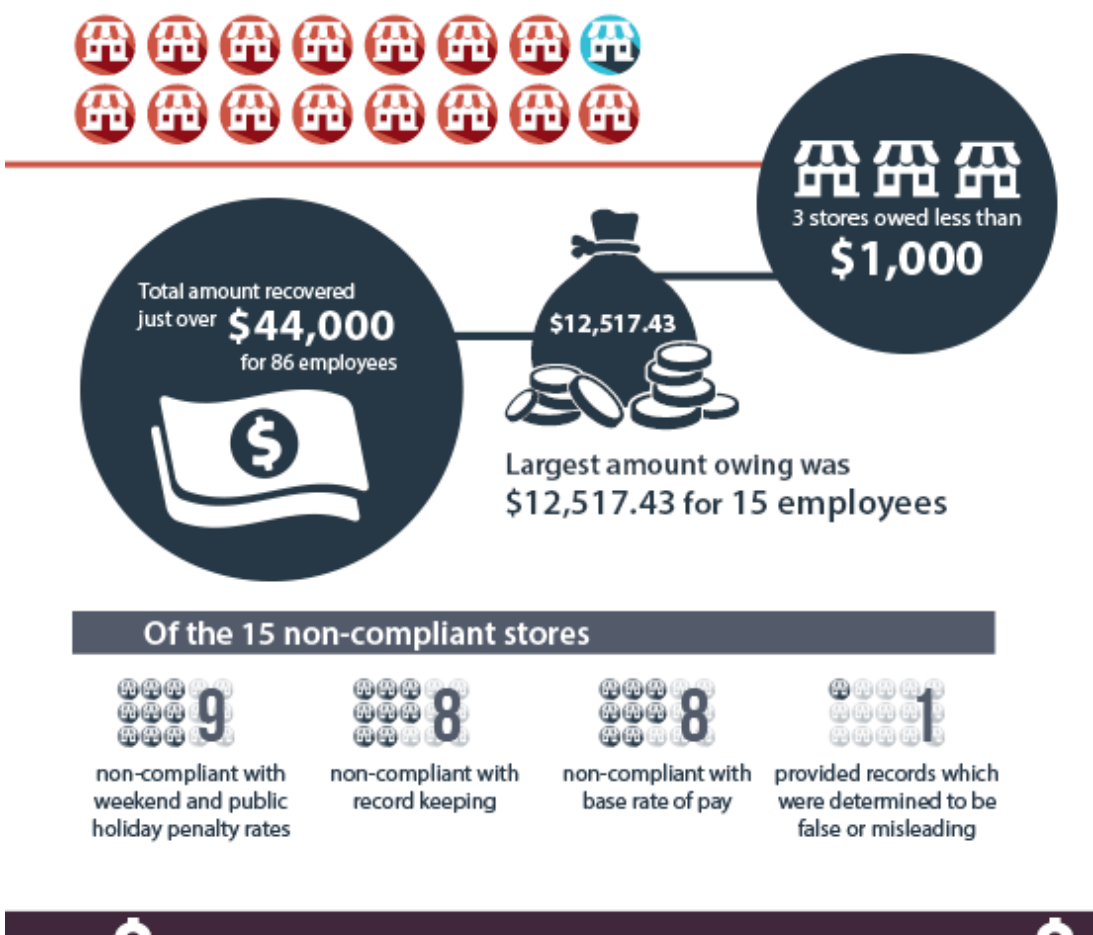
Figure 2: Infographic summarising compliance activity results

The stores included in the Activity employed between one and 20 employees. In total, 121 employees were included in the Activity, of which, 41 were under 21 years of age (33.8%) and 12 were visa holders<sup>17</sup> (9.92%).